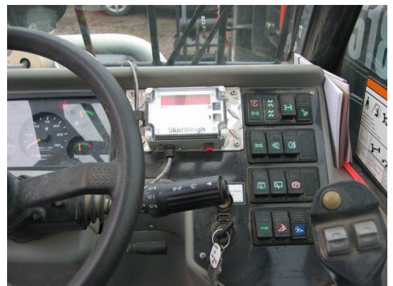
Your Local Forklift Dealer