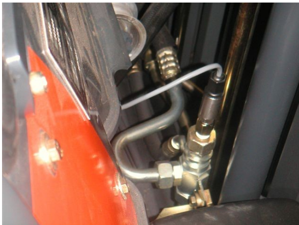
Typical Hydraulic Pressure Transducer Installation

Every time a skid load is picked up the increase in the hydraulic pressure in vehicle lifting circuit will automatically activate the "weighing cycle at sample rate of 1600 readings per second" and convert it to a load weight measurement that is visually presented to the operator via a five digit large display.