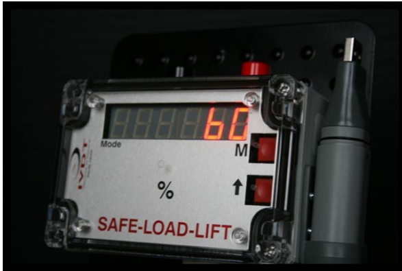
ED2-SLL-Buzzer SkidWeigh Kit with optional data logger

When the load weight is not clearly marked or not marked at all and loads are moved and lifted to the different lifting heights, there is a danger of the vehicle stability.