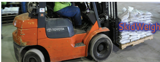
The installed system is calibrated automatically by lifting known load weight on the forks