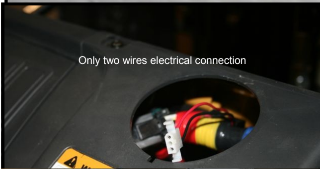
Only two wires electrical connection