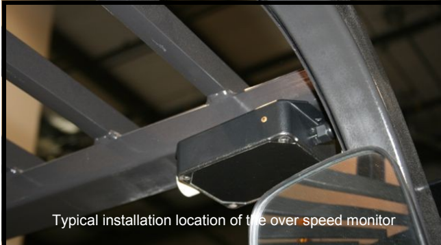
Typical installation location of the over speed monitor